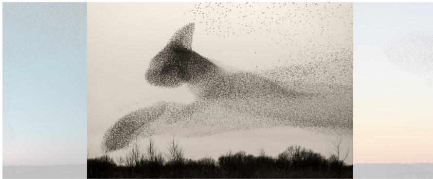
Stunning photographs capture starlings migrating through Europe

can. A friend sent me a nice holiday card with a picture from the great sand dunes. It was fractal in nature (which is redundant). This sweet potato skin struck me as fractal too. Delight!